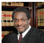
Judge Solomon Oliver, Jr. , United States District Judge of the United States District Court for the Northern District of Ohio