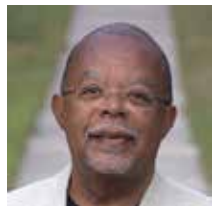
Dr. Henry Louis Gates, Jr.

The Legal Aid Society of Cleveland's 117th Annual Meeting is an afternoon program and reception on Friday, December 2, 2022 at the Renaissance Hotel in downtown Cleveland. Legal Aid's annual event will highlight hope, extend gratitude, and provide updates on high-impact community partnerships and initiatives. Additionally, Legal Aid leaders will unveil the organization's new strategic plan.