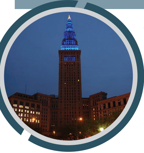
The Terminal Tower was lit blue to honor the American Bar Association's National Pro Bono Week.

On October 26 – everyone in the city could see the legal community's commitment to Legal Aid: the Terminal Tower was lit blue to honor the American Bar Association's National Pro Bono Week . This special week honors the work of pro bono volunteers nationwide. In Northeast Ohio, the celebration includes Legal Aid, numerous bar associations, the judiciary, community based organizations and volunteer attorneys.