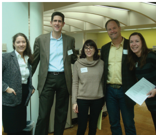
Attorneys from Eaton Corporation and Squire Patton Boggs volunteer at the Memorial-Nottingham Branch of the Cleveland Library.