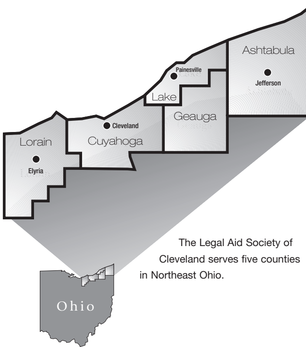
The Legal Aid Society of Cleveland serves five counties in Northeast Ohio.