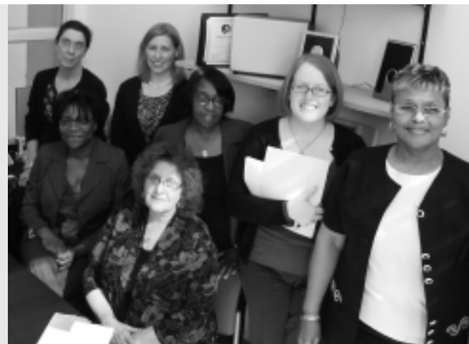
Members of the Family Law Unit