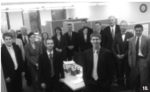
10. Attorney-volunteers from Medical Mutual of Ohio and the law firm of Calfee. 11. Attorney-volunteers from Developers Diversified Realty and Jones Day at a Legal Aid clinic at Neighborhood Housing Services in the Slavic Village neighborhood.