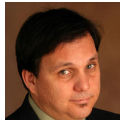
Tipoff: The governor turns on the turnpike ( http://www.cleveland.com/tip )