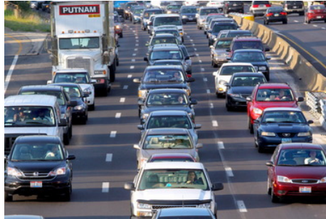
US Fidelis told customers its extended service plans provided "bumper to bumper" coverage, but consumers said they were stuck with repair costs.