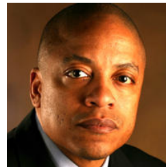
Morris: Grass Cutting for Dummies during foreclosure crisis ( http://www.cleveland.com/mc )