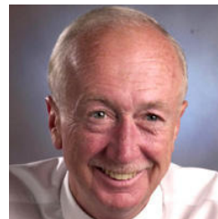
Larkin: Even if it runs like a judge, it still may not be one ( http://www.cleveland.com/opi )